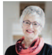
Dr. Katherine Zappone